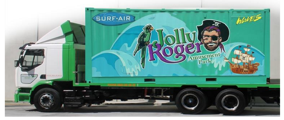
Portable Surf Air - 20ft Container