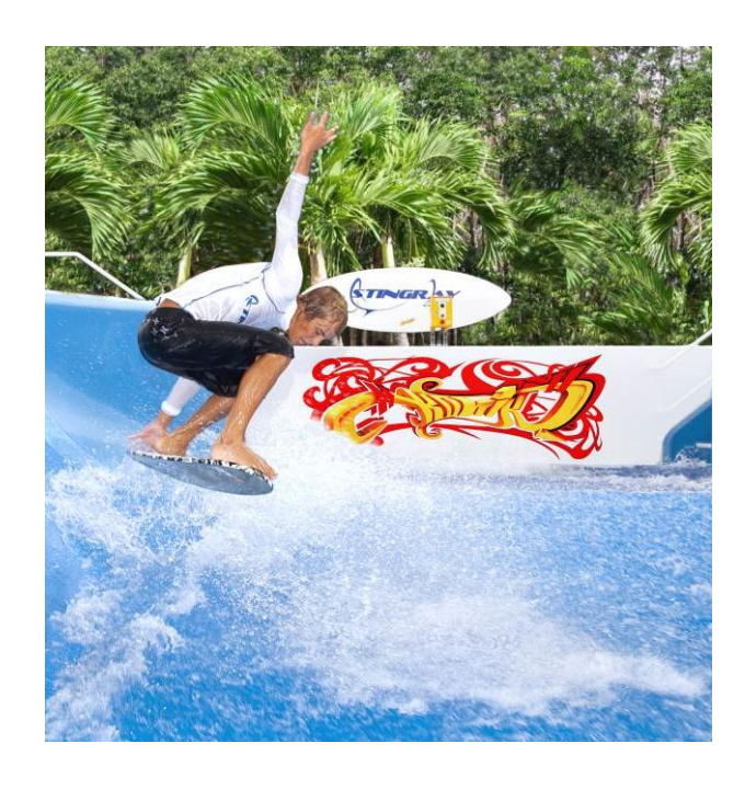
"Thank you for choosing Murphy's Waves Ltd"

Customer care is extremely important to us and we take great pride in having a 100% customer satisfaction policy. Should any customer be unhappy with the quality of equipment or service received then we would kindly request that the complaint is brought to our attention immediately in order that we can effect the appropriate action. As part of our ongoing Quality Control Audit each client will be asked to complete a Customer Satisfaction Questionnaire at the end of the warranty period. We would be grateful if you could spend a few moments to complete the questionnaire and return it to our head office.