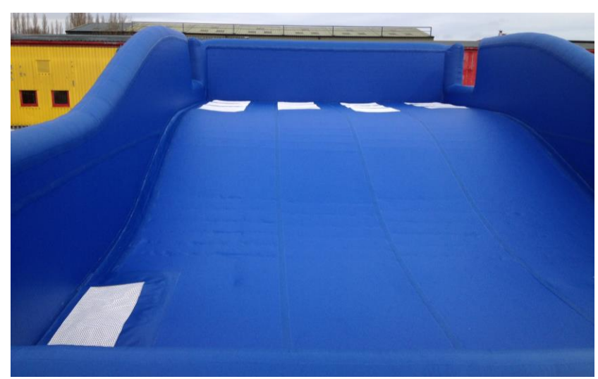
Surf- Air Inflatable Ride Surface

As part of our after care service we are pleased to offer an annual service contract. This is normally undertaken at the start of the season to ensure the smooth operation of the generator, and that the Stingray is tuned to peak performance.