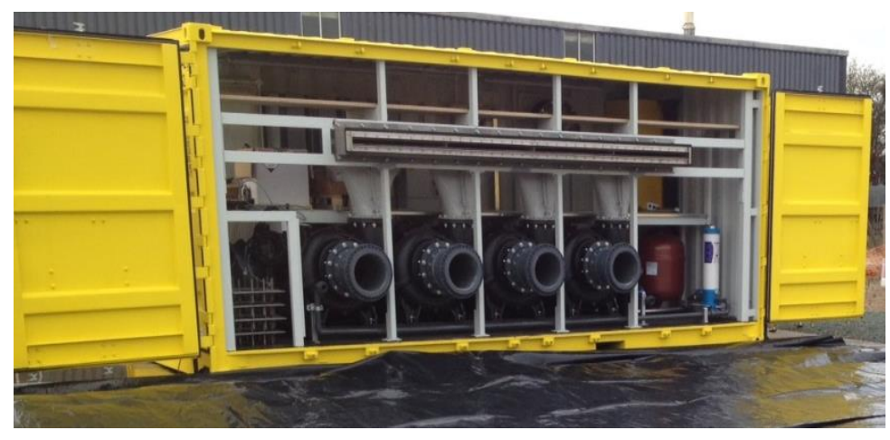
Surf-Air Technical Equipment & Container